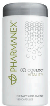
Form #120 - v1.2 April 2013